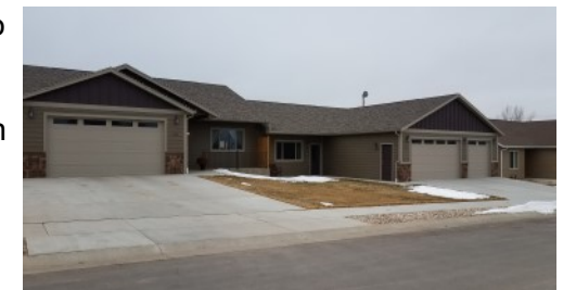
Townhomes in the Canyon View Subdivision.